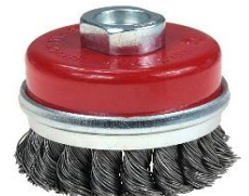
Rigid twisted rotary wire brush

All rotary brushes are designed to fit angle grinders with M14 thread attachments. The rotary brushes are supplied in merchandised display boxes, ideal for countertop displays or for wall bay/gondola shelving. (Please note VLC1048 & 1049 are available in singles). Please see below for information on applications, dimensions and pack quantities.