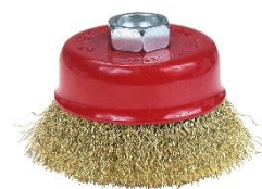
Brass plated rotary wire brush

Vapormatic has introduced a new range of rotary wire brushes for use with angle grinders and to suit a variety of applications for heavy duty cleaning, rust removal and preparation of surfaces.